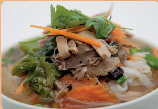
201 Noodle soup for the little ones